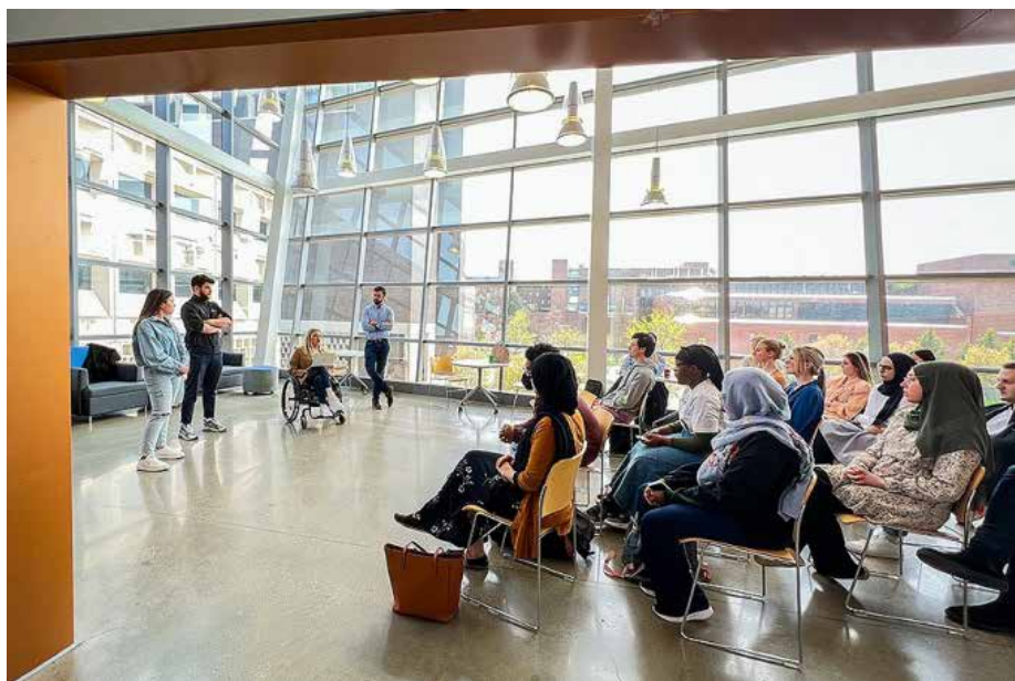
Four BOLD fellows presenting to the rest of their group

"One of the vital components of Bosnia and Herzegovina's ecosystem is its human capital with a hard-working