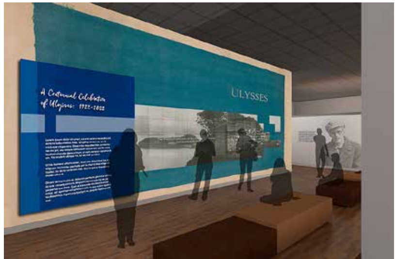
A rendering of the future James Joyce Museum space in Abbott Library

The collection, currently housed in Capen Hall on the