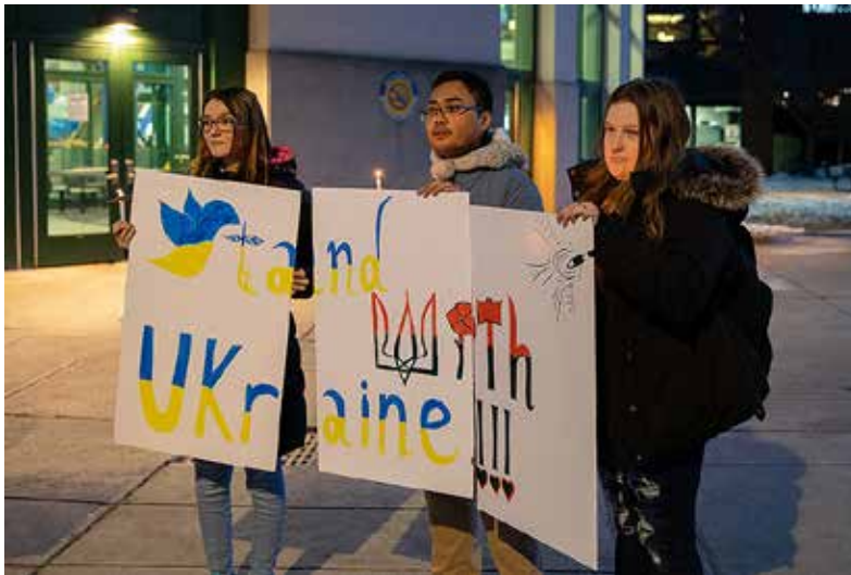
UB students at a vigil for Ukraine in February 2022 (Forrest Kulwicksi)

President Tripathi issued a statement soon after the invasion began: "As we look upon the Russian invasion of Ukraine with disbelief, anguish and horror, our thoughts are with the Ukrainian people and the extended Ukrainian family across our community, across our nation and around the world. In the moments and days ahead, we will continue to watch and hope that Russia will deescalate its rhetoric and violent actions, and retreat from the sovereign nation of Ukraine.